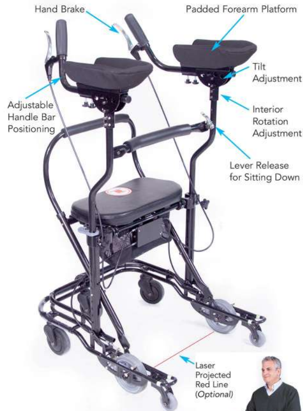
Model #: US-PC2-PL

Ideal for Stooped Posture, weak upper body, stroke, brain injury. Highly adjustable for optimal setup.