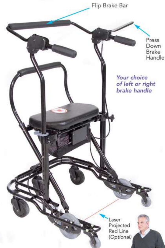
Model #: US-PC2-PD

Ideal for those with weak or no hand strength to squeeze a standard hand brake. To go, press down on the brake handle or the flip bar. Choose left or right brake handle.