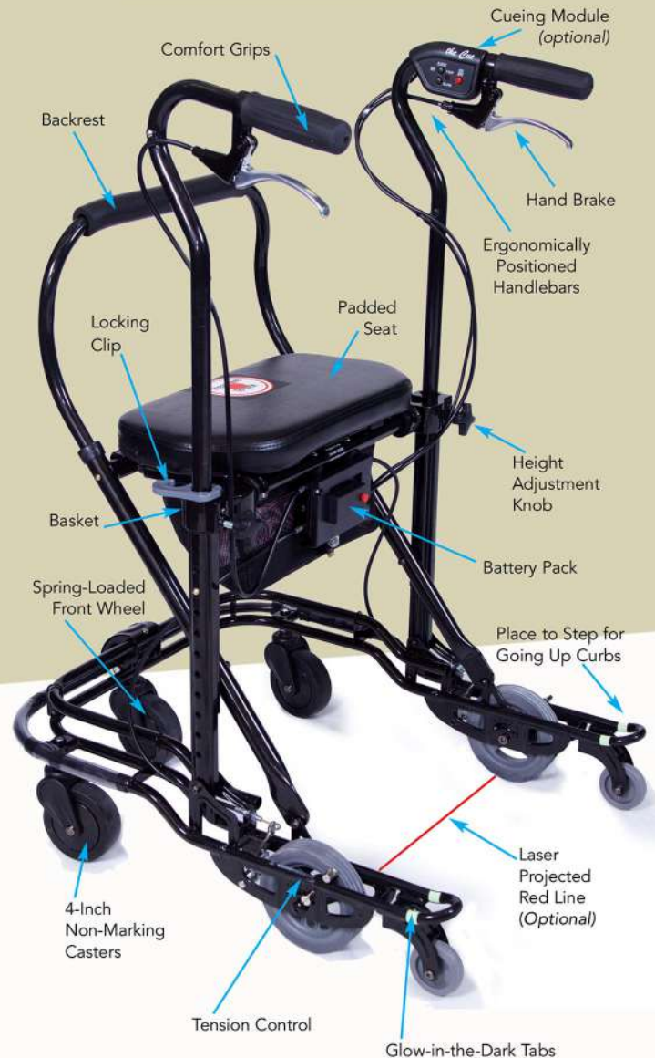
Model #: US-PC2